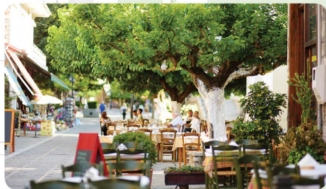
New public retail plaza on Kettle Street connected to local bike and walking routes