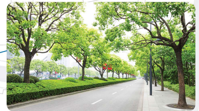
More street trees and improved footpaths