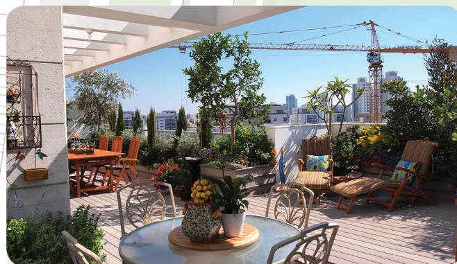
Green roof tops and central outdoor space for new residents