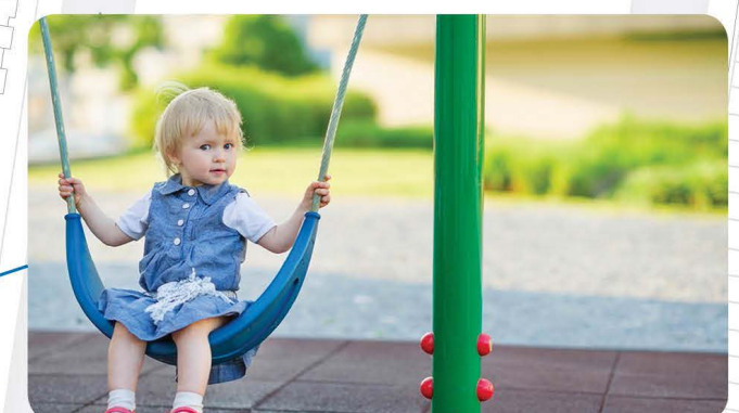
Communal garden on Phillip Street to transition to the heritage area